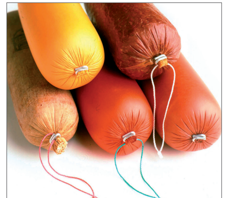
Sausages with crossover clips