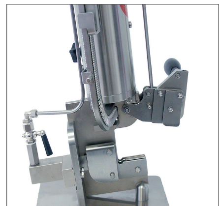
Triggering of the gripper and cutting knife that can be shut off.