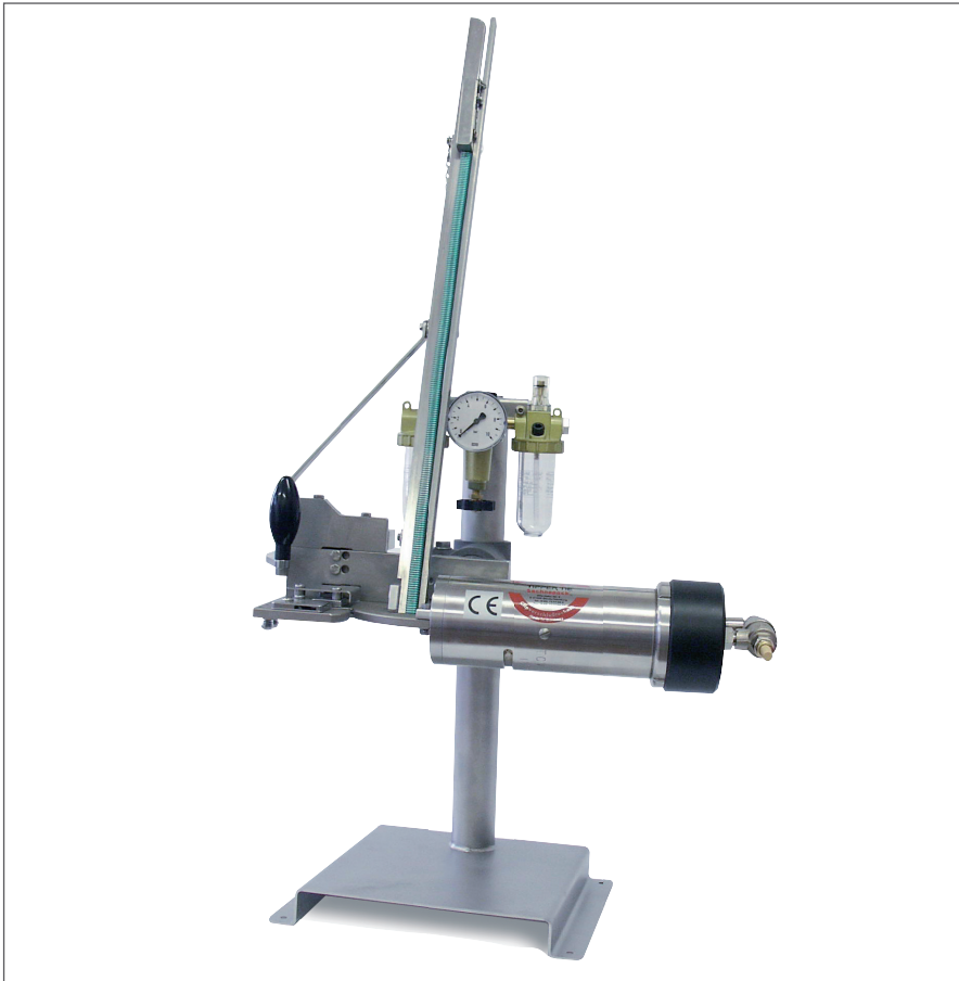
Horizontal version TCV406H for upright bags