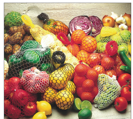
Products packaged in nets