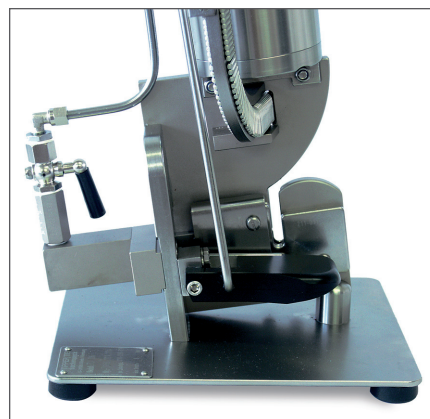
Triggering of the sensing lever and cutting knife that can be shut off.