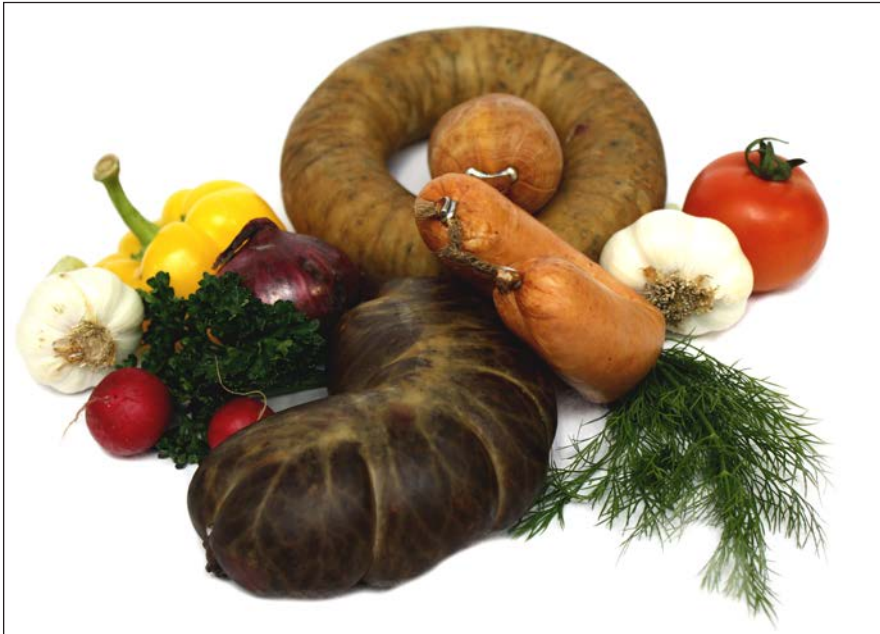
Natural casing sausages with flat clips