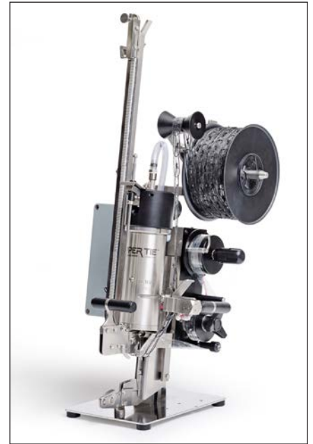
TCNV with automatic loop feeder