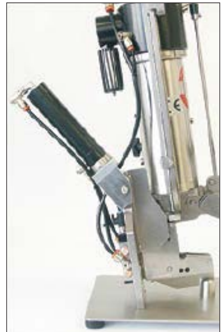
Pneumatic cutting knife